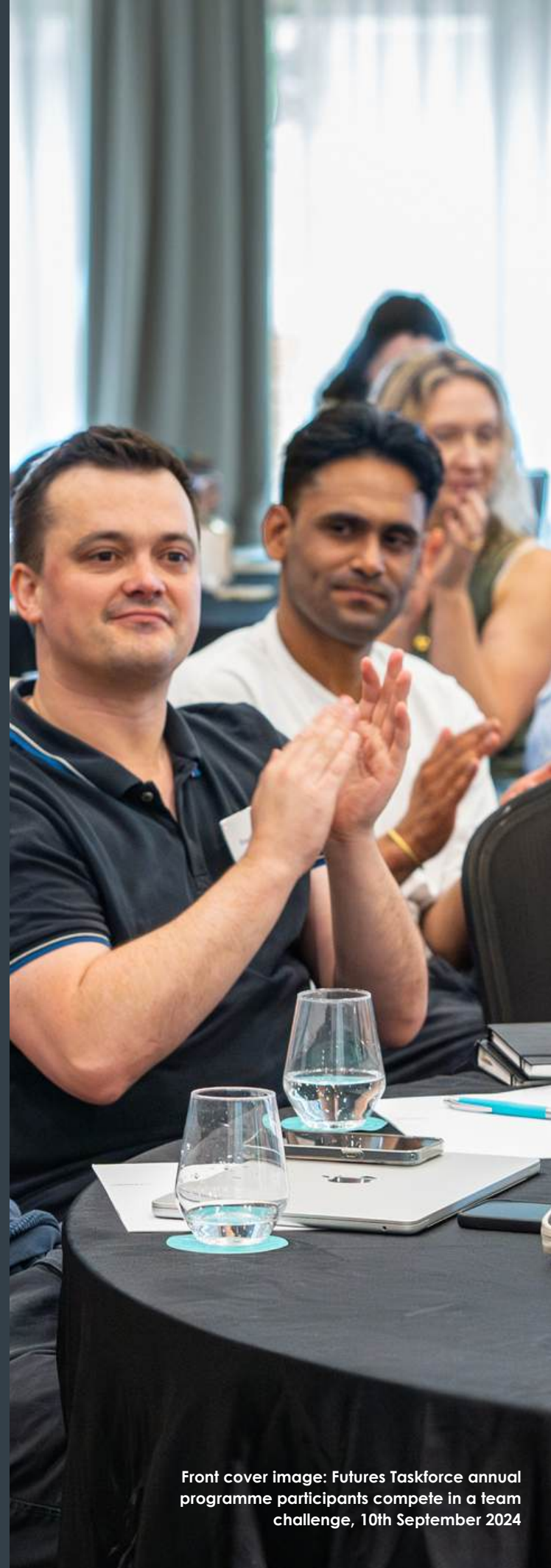
Front cover image: Futures Taskforce annual programme participants compete in a team challenge, 10th September 2024